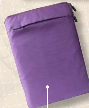
Soft Case (choice of colours)