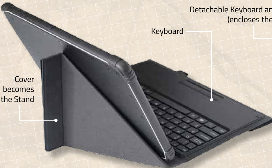
Cover becomes the Stand