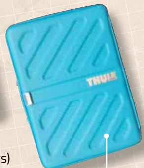
Hard Case (choice of colours)