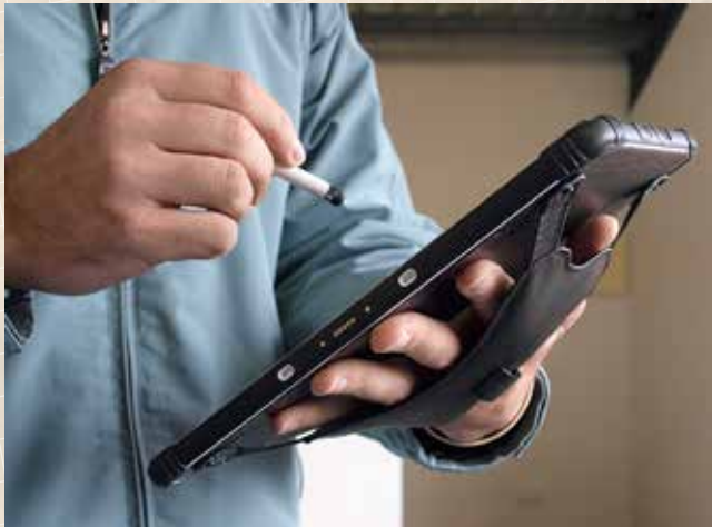
Using the Rhino X-8 in the portrait position