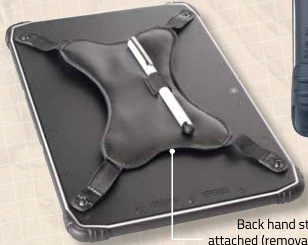
Back hand strap attached (removable)